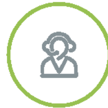
Oversight and Monitoring